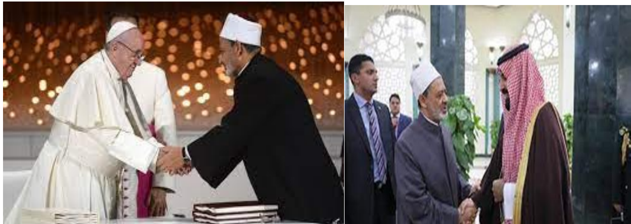
POPE FRANCIS AND MYSTERY BABYLON

This has always been another one of Satan's strategies over millennia, to do everything in his power to prevent mankind from ever learning about the salvation and forgiveness that Jesus Christ offers them.