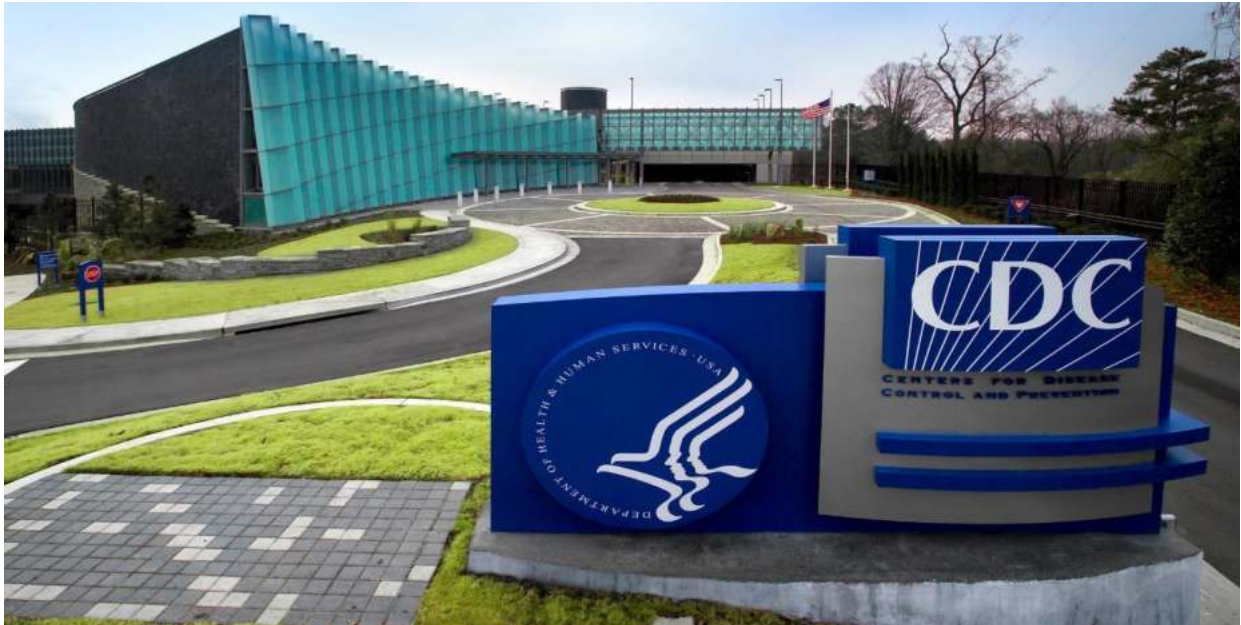
CENTER FOR DISEASE CONTROL: CDC

THIS GLOBAL EFFORT IS PART OF THE UNITED NATIONS SUSTAINABLE DEVELOPMENT PROGRAM. IN FACT, THE WHITE HOUSE ISSUED A FACT SHEET IN FEBRUARY 2022 ENDORSING THE UNITED STATES’ COMMITMENT TO THE GLOBAL HEALTH SECURITY AGENDA. You can find this fact sheet on the White House’s website .