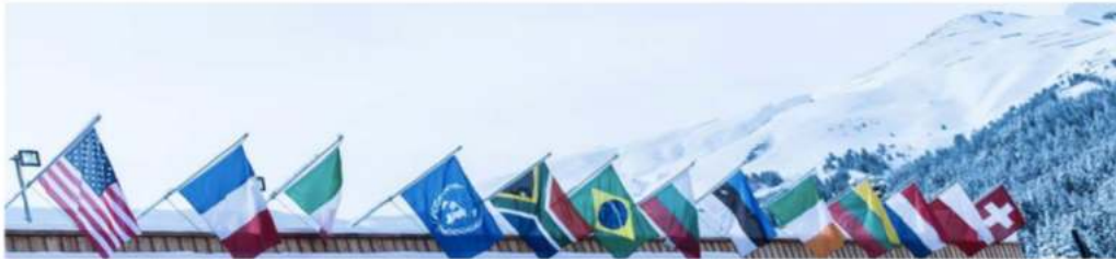
Globalization 4.0: Shaping a Global Architecture in the Age of the Fourth Industrial Revolution

COMMITTED TO IMPROVING THE STATE OF THE WORLD