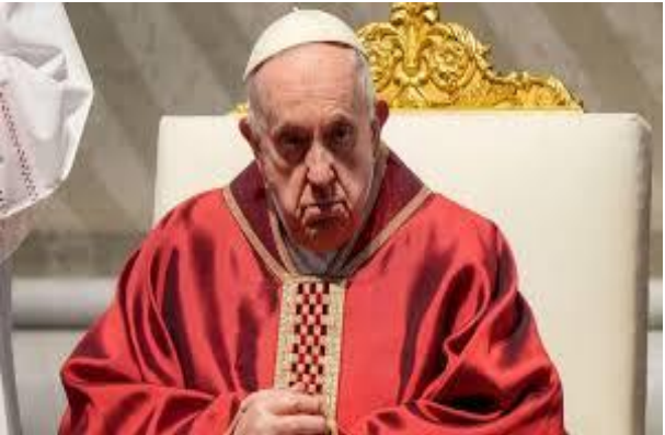
DOCUMENTARY: SATAN, THE FALSE PROPHET AND ONE-WORLD GOVERNMENT